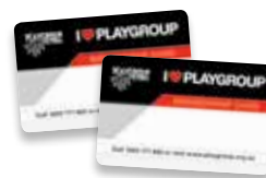
Playgroup Victoria membership card – Australian Baby Card