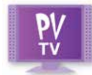
PVTV online video portal