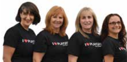
Playgroup Member Consultant