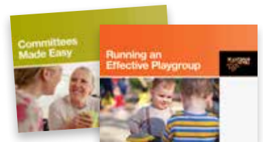
Free induction workshops